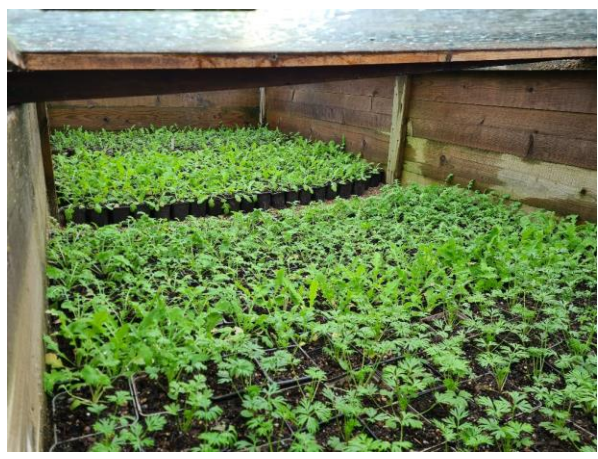
23/02/24 – Hardy annuals growing on in 7cm pots. A mix of Poppies and Larkspurs.