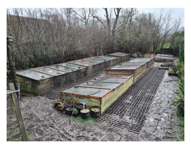
14/02/24 – New cold frames and ground reinforcement panels were added to provide more growing on space and improved access.

Below is a selection of images from throughout the year showing some of the progress and stages of the car park project.