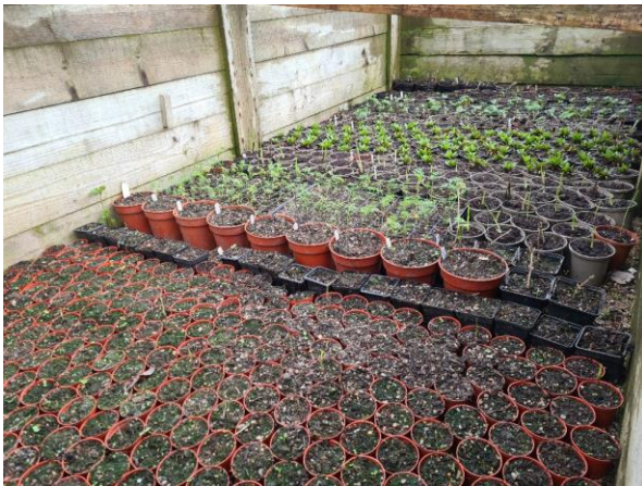
23/02/24 – Recently split plants such as crocosmias and heleniums inside a cold frame.