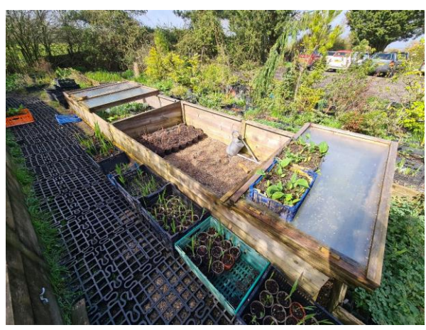
04/04/24 – Grass splits being lined out in the first frame.