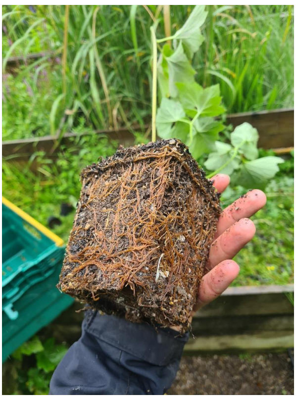
05/07/24 – Well rooted Anemone 'September Charm' which took a considerable amount of time to root, despite having good top growth.