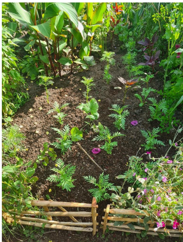
- Pockets within the High Garden stock bed that have been carefully opened up, surrounding plants staked, and new plants put in to continue the show well in to and beyond August -

Another big focus for July was to 'clarify the picture' throughout the whole garden. This inolves observing each area and noting whats working, and what isn't and making edits accordingly. It also means keeping an eye on plants that are finishing soon or would benefit from being rejuvenated to provide a longer display. An example of this was when we spent two as as a team cutting back all the Geranium praetense and planting up the revealed space around each plant with Cannas and Amaranthus. The Geranium leaves had started to turn orange and although to me this was still looking good in combination with plants like Tritelia, a good lesson I learnt was that this is the best these plants will look, and at this time of year there are still many months of the season left, so any way we can prolong their period of interest is the best option. By cutting the geraniums right back to