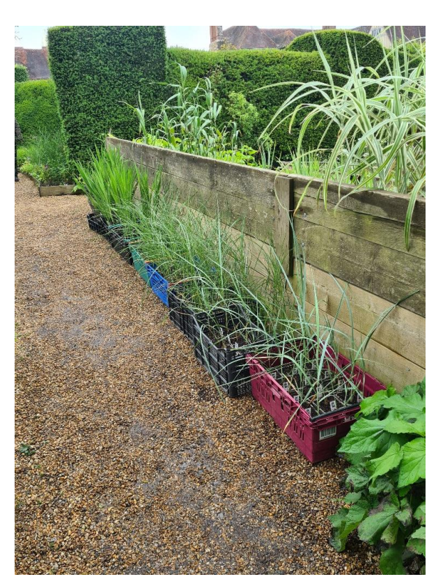
05/07/24 – Crates of freshly potted stock from the car park into 1 ltr pots ready to be sold in the nursery.