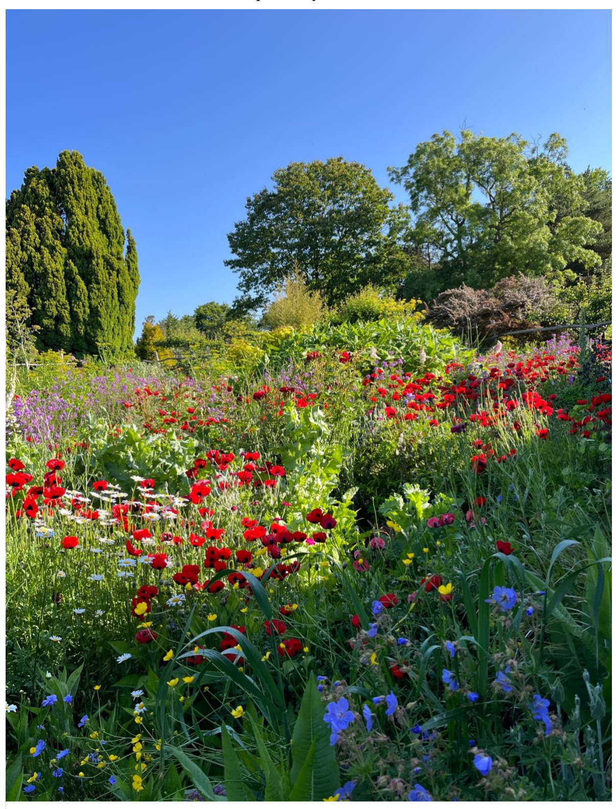
A view of the High Garden poppy moment with Papaver 'Ladybird' and Silene 'Blue Angel'