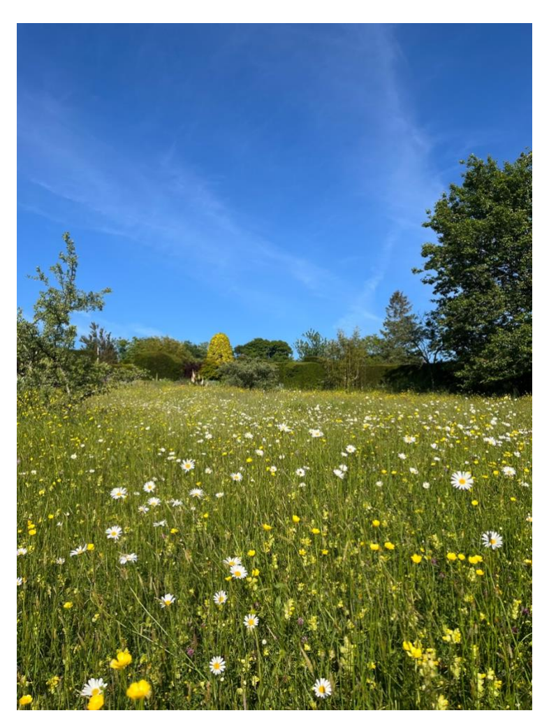
The orchard meadow below the long border with yellow rattle and ox-eye daisies in bloom.

textured turf. The English hay meadow has a fascinating history and management that differs in many key respects to the grasslands I am familiar with back home. particularly the sandplain grasslands and fire-adapted ecologies which are more common in southern New England. Many of the British native grasses are cool season growing and form turfs, so they continue to grow through the winter and remain more or less green for the whole year. They are also maintained with a seasonal cut for making hay, which at Dixter occurs in August and September. We cut again in November to mimic aftermath grazing, which opens up the sward texture and allows for the emergence of many fall-germinating seedlings. Our native grasslands are largely composed of grasses that are warm-season growing and form tussocks instead of turfs, and they go brown in the winter and do not fully emerge into growth until after the passing of the last frosts. These