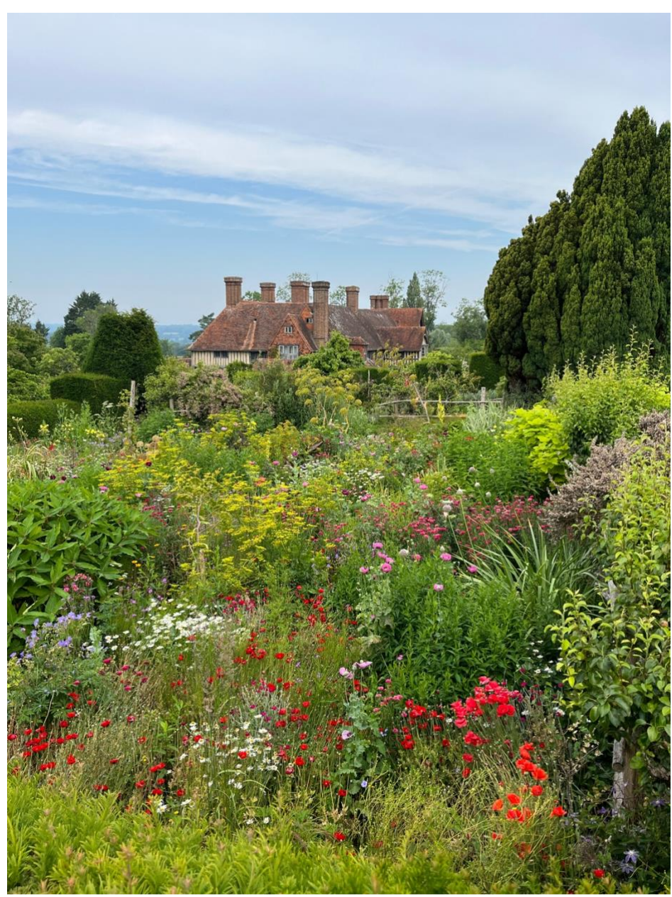
The fading poppy display in the high garden. The yellow umbels of parsnip are visible in the center of the bed, where they provide some much needed height and clarity of color.

displays last longer, and as a result many of the poppies held on to their color for a few weeks longer, which helps keep a lot of color in the borders in June. This can also prove challenging since it delays the timing of our bedding changeovers, which runs the risk of creating big holes in the borders once we changeover the annual bedding pockets in July. Its critical then to stagger our changeovers so that we slowly work in new plants, opening up a few pockets at a time to soften the crash when the annuals finish blooming. We also use many large umbellifers, such as parsnips (Pastinaca sativa), to provide a bridge in the June