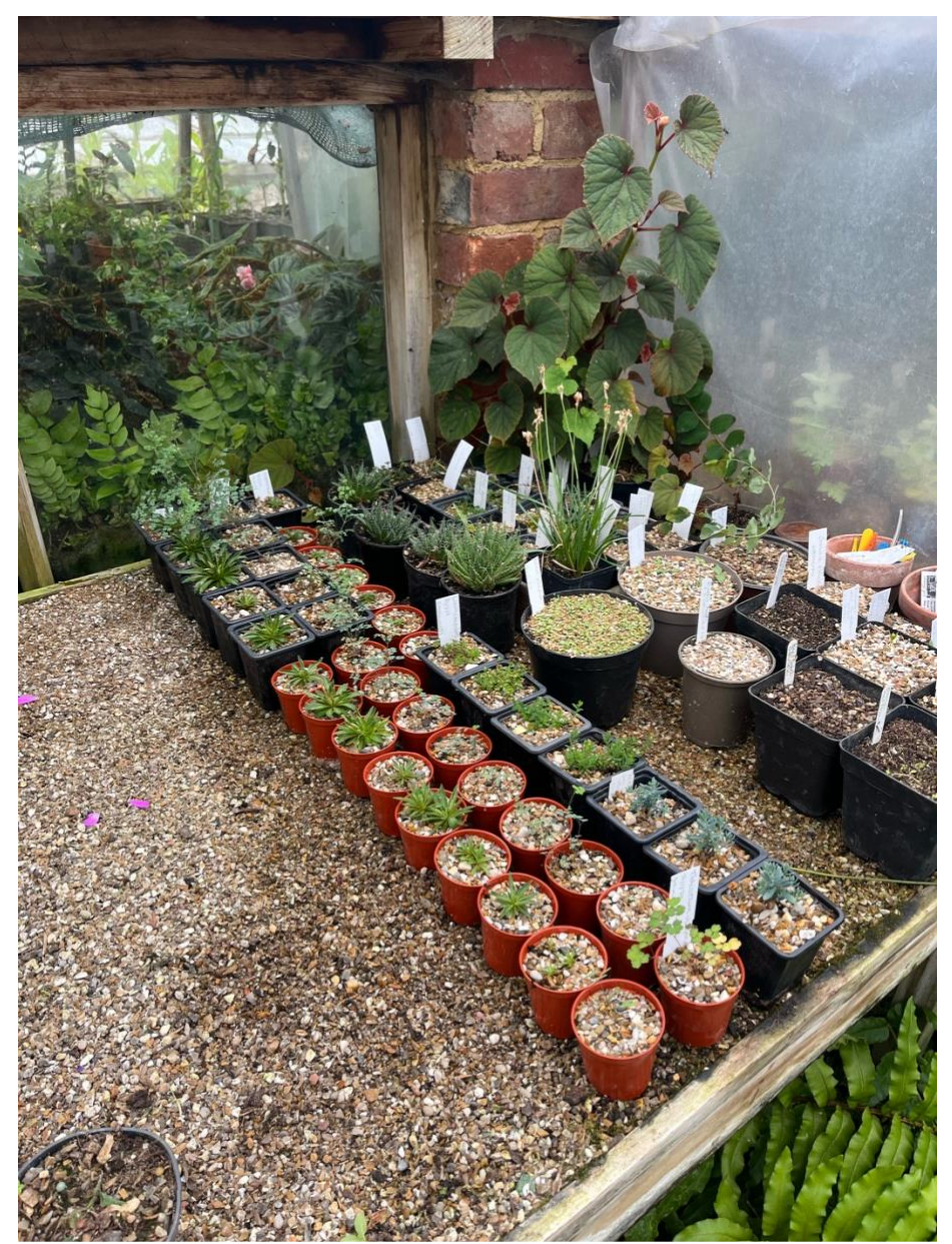
A few rows of alpines which I raised from seed this spring and pricked out into small pots, ready for planting in the fall.

people walk. And, I will also never be particularly endeared to Pastinaca as it is an extremely unpleasant invasive plant in the US. Purely from an aesthetic point of view, it is a very beautiful plant, and its capacity to re-right its flowers upward after flopping makes a tiered cascading effect which is very useful for covering a large gap with flowers.